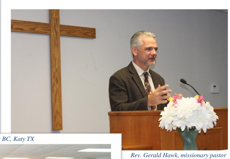
Good News BC, Katy TX